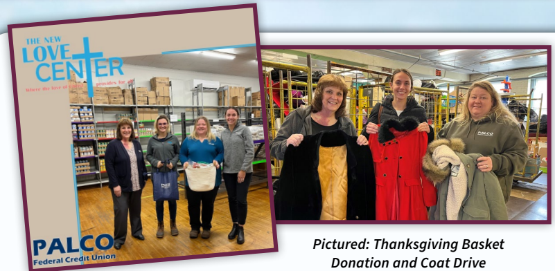
Pictured: Thanksgiving Basket Donation and Coat Drive

$ Hidden within this newsletter are four account numbers spelled out. If you find your number, give us a call and we will deposit $25 into your account!